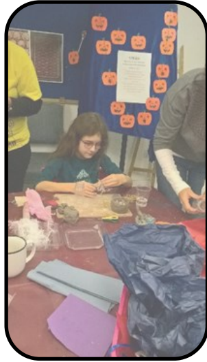
Having fun at the Ashmolean