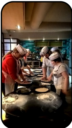
Making pizzas at Pizza Express